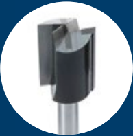
3-cutter plunge tip